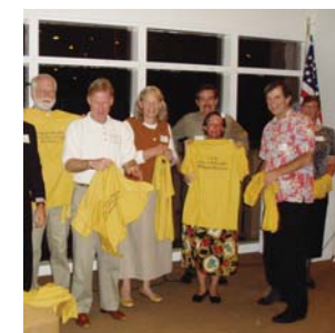
Public Education Committee receives T-shirts after completing their volunteer service.