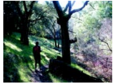
Apricots to Mountain Tops Trail

Where: Meet at Pathway Marker to Packard Orchards, Elena Road and Josefa; next to Foothill College. Parking available along Josefa. Bring water. No dogs please.